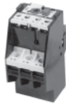
IEC Adjustable Overload

IEC Starter (contactor) and overload are mounted on rail, P/N 111387